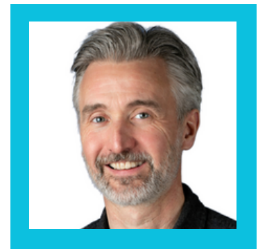
Ombuds 3 555-555-5555 Email@mwi.org